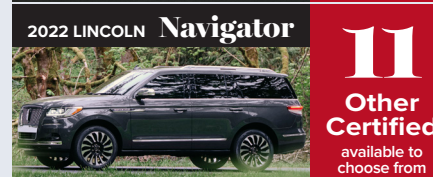
2022 LINCOLN Navigator

Plus - Navigator to Navigator Loyalty Cash $2,000 OR Cadillac, Full Size SUV, and Conquest Cash $5000 if applicable