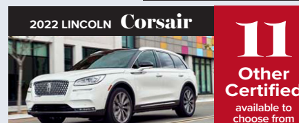
2022 LINCOLN Corsair

36 MONTH LEASE INCLUDES $0 DOWN, $0 SECURITY DEPOSIT, $603 FIRST MONTH'S PAYMENT DUE AT SIGNING, EXCLUDES TAXES & FEES, W/LINCOLN AFS APPROVAL, PURCH OPTION $33,004.60, 7,500MI/YR, STK#5LMPJ8J8TJ005083. LCTP LOANER W/UNDER 5K MILES