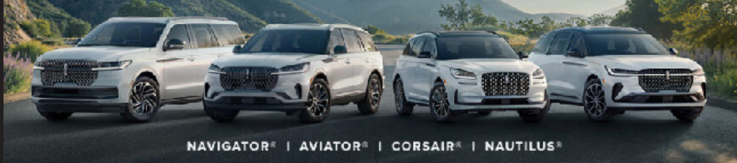
NAVIGATOR® | AVIATOR® | CORSAIR® | NAUTILUS®