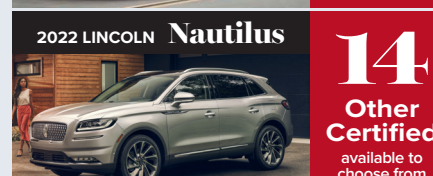
2022 LINCOLN Nautilus

11 Other Certified available to choose from