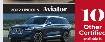
2022 LINCOLN Aviator

10 Other Certified available to choose from